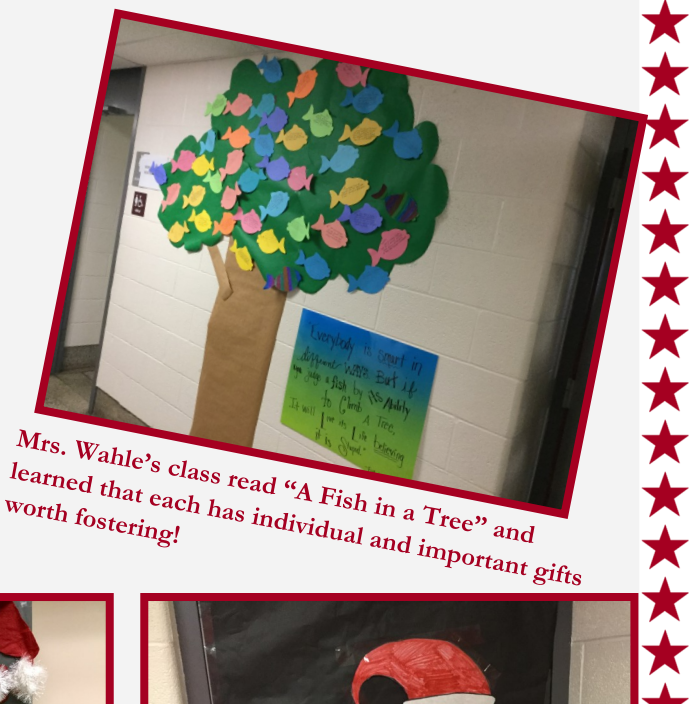
learned that each has individual and important gifts