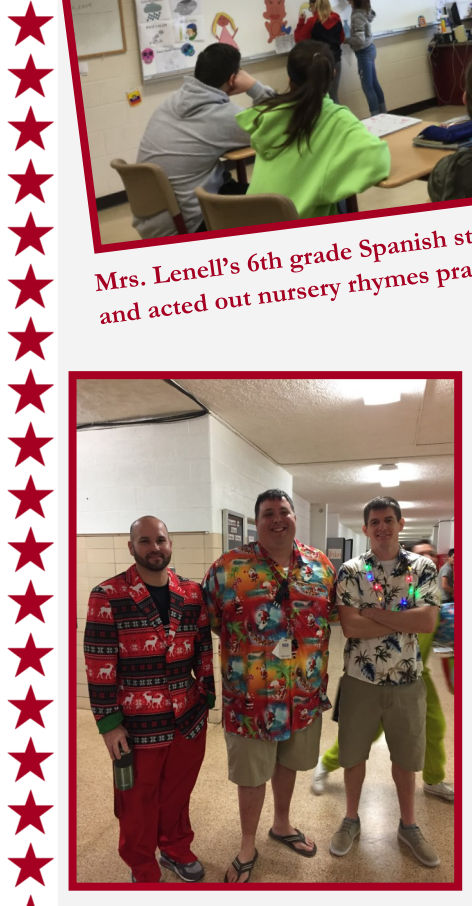
UMS staff celebrating the holidays with interesting outfits!!!