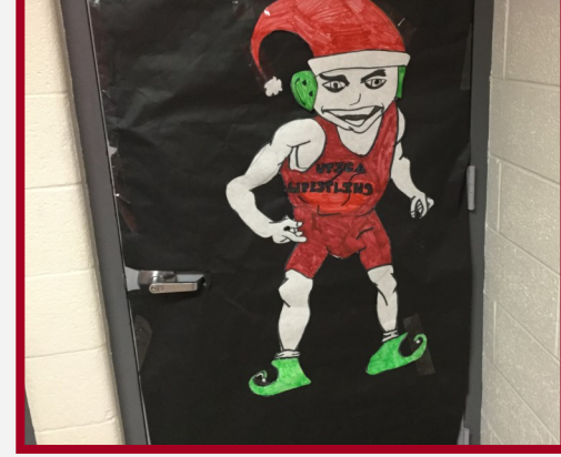
Our holiday door decorating effort was exciting and well received. The effort brought out the artist in ALL of us! Look for more inspired doors during Right to Read Week!