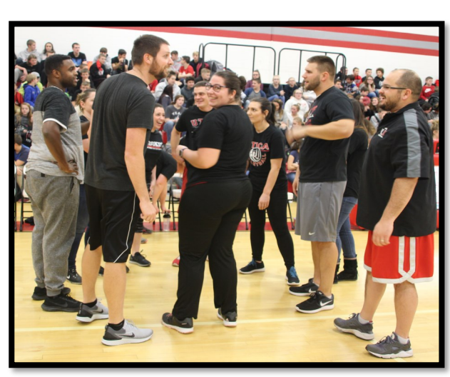
UHS team huddle!